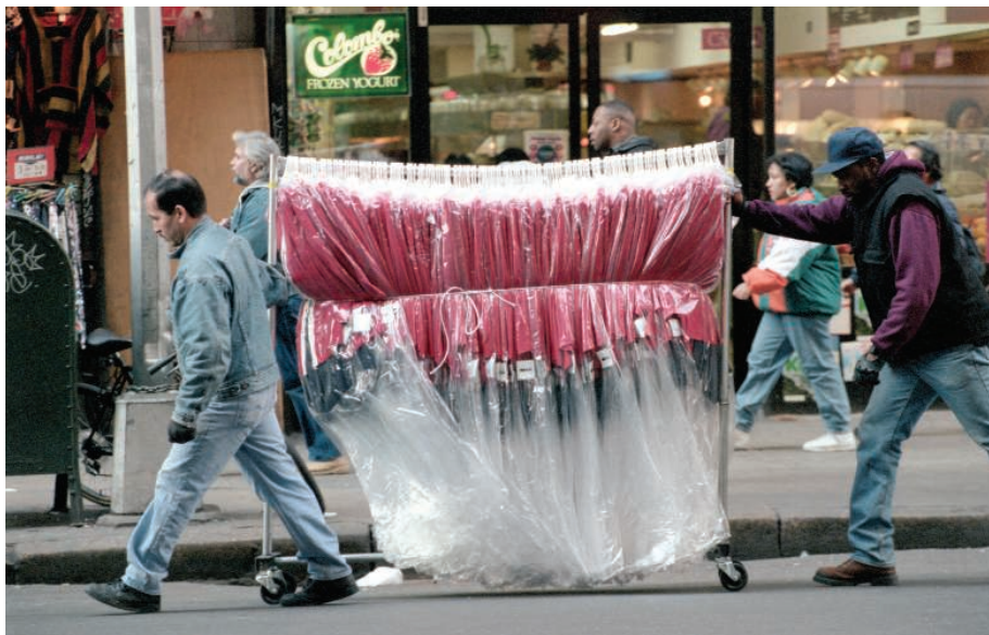
Shrinkable. A study in New York City's garment district found that social networks remained strong during a period of attrition.