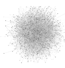
Figure 2: Initial state with undecided majority (grey), proponents (light grey), and opponents (black)

There are, however, examples of systems where the abstract models enabled discovery of unexpected universality of opinion change processes. An example of such discovery is the existence in the voting process of a general microscopic dynamics that does not depend on the historical, political, and/or economical context where voters operate [6].