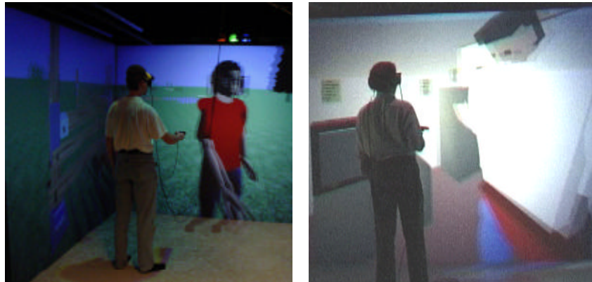
Figure 3: Examples of close, face-to-face interaction. Left: Two participants meeting in the Gazebo application. Right: Two participants discussing the task in the Poster application.

There is a difference between how participants treat each other's avatar depending on the stage of the task and their focus: at the beginning and end of each of the five tasks, avatars would generally stand facing each other and treating each other as in conversation with real people. Figure 3 shows two examples of this from different tasks. In the Conversation task, without out exception the two participants would stand directly facing the other's avatar for the complete conversation. In longer trials or in trials involving object interaction there was a definite middle phase when they would only react to collisions with or proximity to partner's avatar when necessary, and otherwise would seem not to consider it important. For example, in the course of one session, one person stood inside another's avatar for several seconds. On other occasions, a person would go through the other's avatar several times within a short time. Avatar embodiments would thus be noticed if they were related to the task, for example when one person was blocking the other person's view in the Poster task: