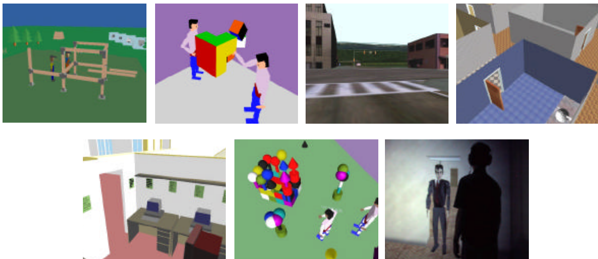
Figure 1: Snapshots of the worlds used in the seven applications discussed in this paper. From top to bottom and left to right: Gazebo, Rubik's, Landscape, Whodo, Poster, Modelling and Conversation.

Several varieties of immersive technology were employed. The trials under consideration always used at least one IPT system. The Conversation task used an IPT and a HMD. The Gazebo task was occasionally run with three IPTs. The IPTs were all four-sided (three walls and a floor) with the exception of the Chalmers TAN VR-Cube which was five-sided. All used some type of SGI Onyx computer to drive the displays. A variety of tracking technologies were used, though for all systems the participant's head and one of their hands were tracked. The HMD used in the Conversation task was a Virtual Research V8. In all trials, the participants could talk to each other. This was usually achieved using the Robust Audio Tool (RAT). Participants were represented to each other using avatars. These avatars had freely moving hands and head. The body would rotate in azimuth only under the head, and the right or left arm would bend to fit between the tracked hand and the relevant shoulder. The participant would not see their own avatar.